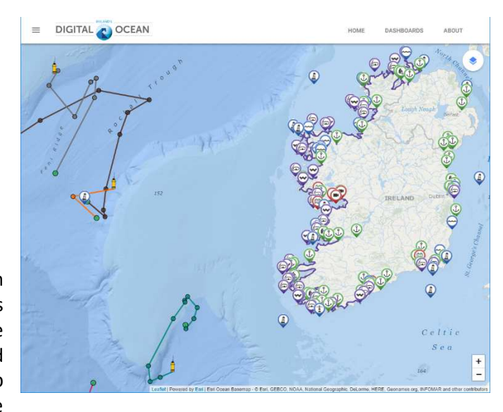
Figure 2: Ireland's Integrated Digital Ocean portal (http://www.digitalocean.ie) showing locations of live data feeds and static information points.