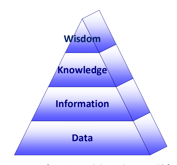
Figure 1: Data-Information-Knowledge-Wisdom pyramid (after Rowley, 2016).

Since the introduction of the Digital Ocean platform, a number of technical developments have been undertaken in order to increase the breadth of data in the portal. These have included the introduction of tile services, over Web Map Services, for INFOMAR sea bed mapping data to the Digital Ocean as the WMS layers proved to be non-performant for end-users. Modelled data from the Marine Institute's operational forecasts have been incorporated into the platform through extension